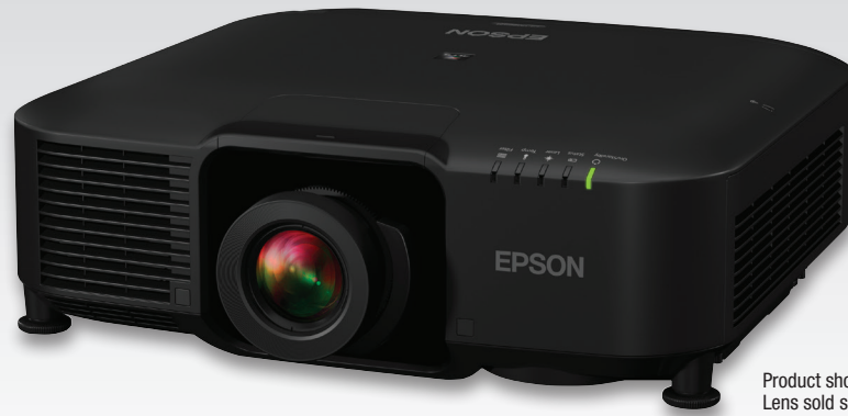
Product shown with lens. Lens sold separately.