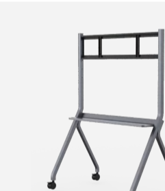
Mobile Stand (ST41B)