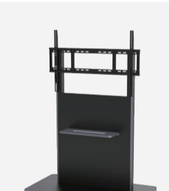
Mobile Stand (ST23C)