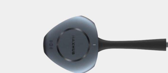
Wireless Dongle (WT13)