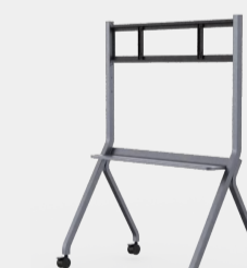
Mobile Stand (ST41B)