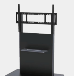
Mobile Stand (ST23C)