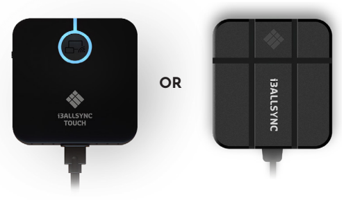
USB C TRANSMITTER

You'll need the i3ALLSYNC transmitter. either the HDMI/USB version or the USB-C version, which one fits your current hardware. Both HMDI & USB-C can be used simultaneously on the same display. To communicate with your touch display you'll need the i3ALLSYNC receiver as well.