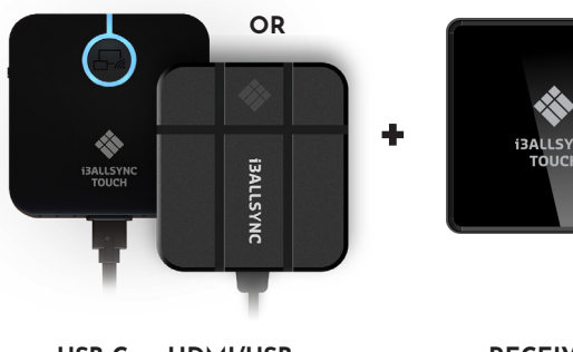
USB C or HDMI/USB TRANSMITTER